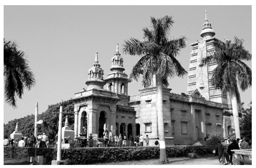
Mulagandha Kuti Vihara (1931 — 2017)