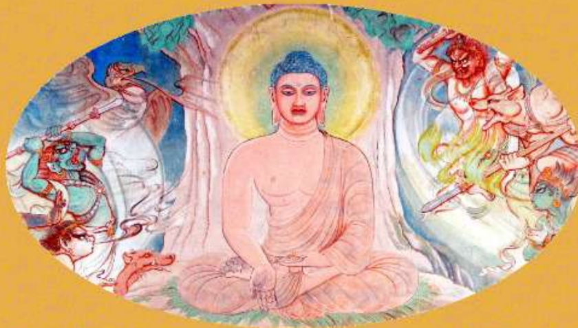
Bodhisattva attaining to Samyak Sambodhi, to be called the Buddha