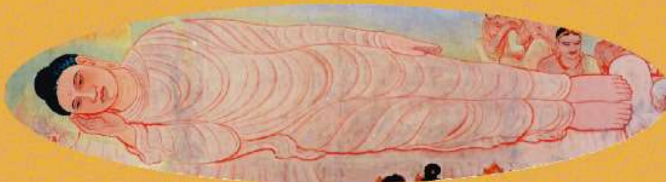
Mahaparinirvana of the Buddha, the 'Great Passing Away'