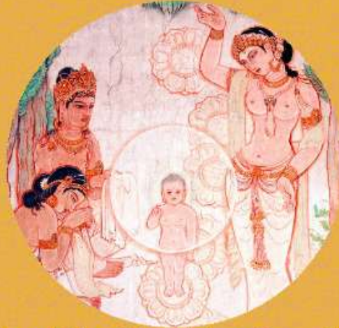
The Birth of the Bodhisattva Siddhartha

The Vesak full-moon Day is of utmost significance as this auspicious day marks the occurrence of three major events in the Life of the Buddha. It was on this auspicious day Prince Siddhartha was born in Lumbini, at the age of 35, he attained to Supreme Enlightenment at Buddhagaya and at the ripe age of 81, the Buddha entered into Mahāparinibbāna in Kushinara.